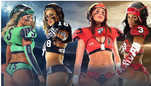
Figure 2. the Legends Football League image

Google search, this study focuses on the promotional contents only to capture the underlined commercial message of the LFL. Thus, presented a promotional films and each season's national commercial was the optimal choice to represent the league images. After collecting the data with rebranding as Legends Football League, 13 videos from ten years' seasons finally selected for this study. Here is the selection of the 10 seasons from 2009 to 2018. These videos were selected and watched from the LFL official channel's promotional content list on YouTube. These videos mostly represented the image of the LFL effectively as a promotional content. Six selected commercial films of the Lingerie Football League were 2009 season 1 teaser Promo , 2009 Game changer commercial , 2010 season 2 teaser , 2011 season 3 teaser: The huddle , 2011 Lingerie bowl commercial , and 2012 Lingerie bowl commercial (extended directors) . After rebranding,